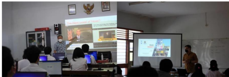
Figure 2. Research Process Documentation

The results of this study have very positive implications for partner activities related to the material presented. Unfortunately, there is very little understanding regarding hoaxes for teenagers so information distortion and misinformation often occur in this phase.