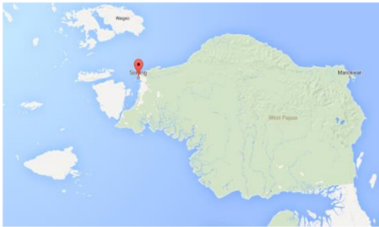
Figure 1 Sorong demographic located in Papua Peninsula

visualize the mapping of the location of the study can be seen in Figure 1.