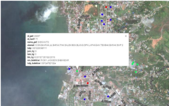
Figure 3 Customer mapping of arrears customer

From Figure 2 it can be seen at one of the regional distribution of the nodes. In Figure 2 it can be seen there are parts collected into one point and has a number, it represents a cluster or area that has a lot of customers that are close together so that they can be combined into a single location at the breakdown when the zoom level increases then the location of the respective customers will be visible. If the node has many customers and outside the region or have a large enough then the node can assign more than one person to assist the collection of bill collectors to customers. In determining the distribution of the collector, then in that area back in the cluster based on the number of collectors who are assigned in the area.