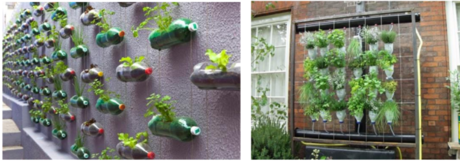
Figure 10. Some Examples of Vertical Garden