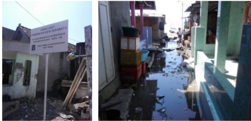
Figure 7. Open Space is Full of Garbage and Suffered from Flooding

trees planted by fraction of society. The trees and plantation do not function as a shelter, thus make the open space extremely hot during daytime. The only available vacant lot is owned by the Municipality and at the present condition is occupied with garbage (see Figure 7 left). Furthermore, the pavement which covers the pathways contributes in high temperatures in daytime and flooding since water cannot be directly absorbed by the soil (see Figure 7 right). The existing pathways can be seen in Figure 8.