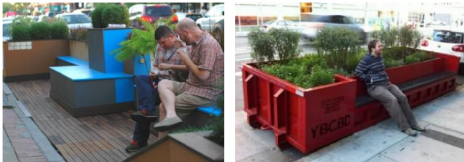
Figure 12. Design for Greeneries Integrated with Sitting Places

The walkways where the community uses for social interaction can be designed integrating the needs of greeneries within the neighborhood (see Figure 12). The vacant place can also be activated as urban farming function and public space with local identity for the community.