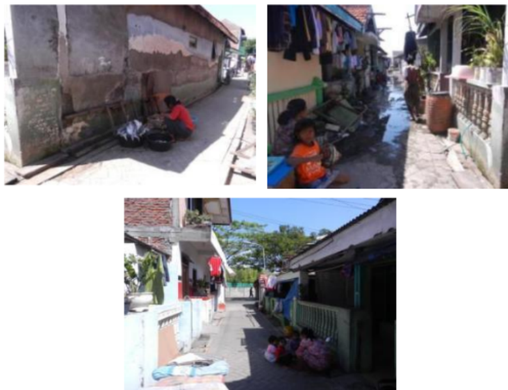
Figure 6. Daily Community Activities in Kampung Kejawan Lor