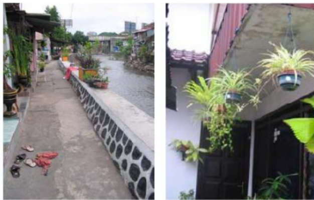
Figure 1. Pots are Used as A Plantation Media

To overcome the scarcity of land problem, the community used pots and hanging pots as a medium for plantation (see Figure 1). Plantation is placed in front of the individual houses as well as in common spaces such as the riverbank retaining wall. The existence of these plants creates a fresh and green ambience within the neighborhood.