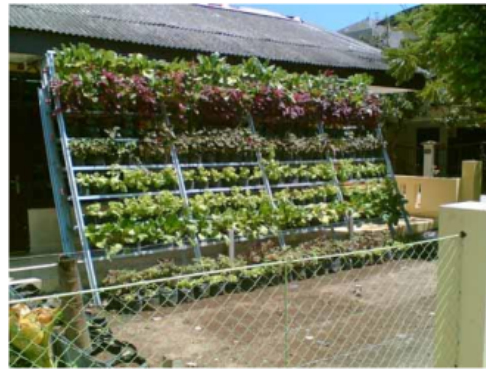
Figure 2. Vertical Urban Farming Functions as A Green Wall