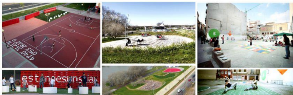
Figure 3. Optimizing Vacant Lot in Estonosunsolar-Zaragosa, Spain Source: http://www.underconstructions.eu/estonosunsolar-spain-2/ in Sari and Shirleyana, 2012)

The implementation of the program involved the Zaragoza Government as the initiator, the planning team, and the local community. In practice, the local people participated both in idea contribution and implementation of public space that suit their needs. The success of this project ultimately spread out throughout the city. There were some number of vacant lots that have been successfully converted into a children's playgrounds, basketball courts, urban gardens and squares, and they became a lively place and are well utilized by the community. The successful factor of this project is mainly due to good communication and cooperation between the government and the community. Direct community involvement from the beginning of the project, implementation and utilization foster a sense of ownership for the temporary created public open space. Sense of ownership and community participation are essential elements to achieve sustainable development.