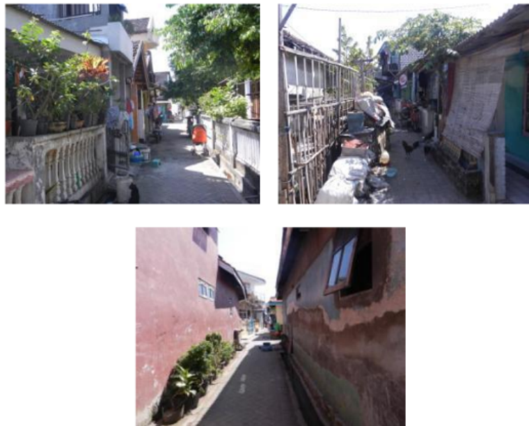
Figure 8. Existing Pathways in Kampung Kejawan Lor