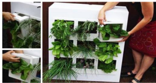
Figure 11. Hollow Block Wall Can be A Place for Plantation