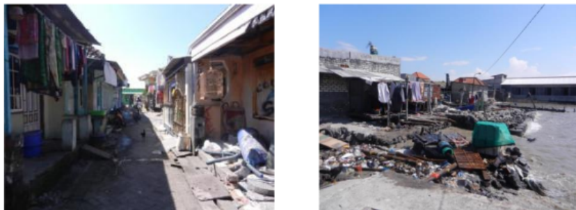
Figure 9. Slum Area of Kampung Kejawan Lor

Other issues raised from the case study is lack of hygiene which can be seen from trashes inside gutter and scattered in some parts of the settlements. Poor sanitary condition has made the impression of this settlement as a slum area and this is even worsened with the habit of drying clothes in front of their houses (see Figure 9). From the interviews with local residents, it is found that the garbage collection happened because of lack of environmental awareness. This can be seen from their habit of throwing households waste directly into sea. Those households waste then returned back to the settlement when high tide came. Besides, there is no proper waste management system for Kampung Kejawan Lor. Moreover, the community does not have a high level of education. Hence, the awareness for environmental concerns and hygiene are absent.